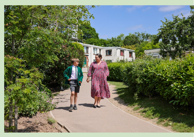
St Peter's Preparatory School is committed to safeguarding and promoting the welfare of children and young people.

You should be aware that provision of false information is an offence and could result in the application being rejected or summary dismissal if you have been appointed, and a possible referral to the police and/or DBS.